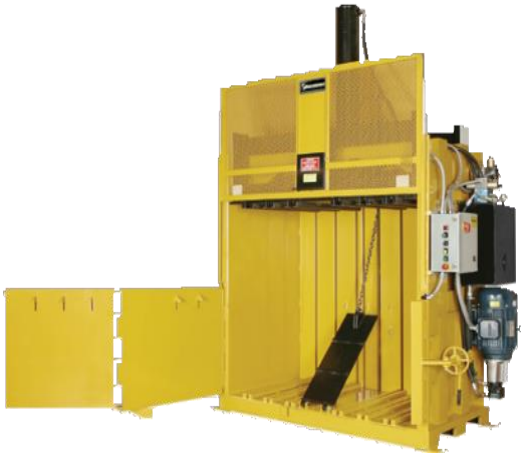
Optional Double Hinged Door Shown