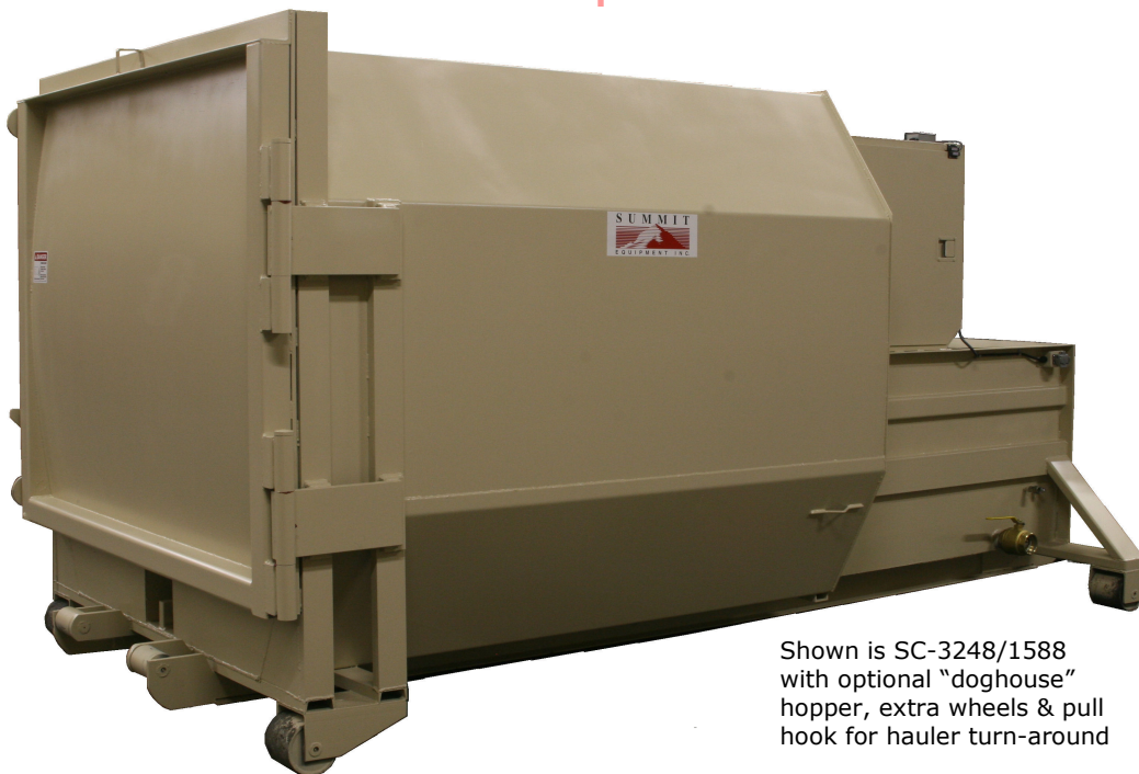
Shown is SC-3248/1588 with optional "doghouse" hopper, extra wheels & pull hook for hauler turn-around

The SC-3248 and SC-4060 compactors are designed to clean up your waste site by capturing and retaining waste, including liquids. At the same time, they reduce the number of times you have to empty, saving thousands of dollars all year long.