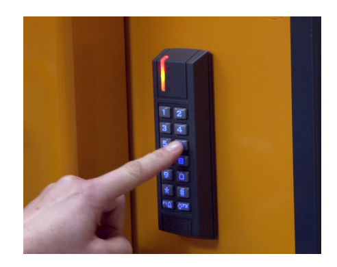
A digital auto lock will prevent unauthorized users from running the baler without a 4-digit code.