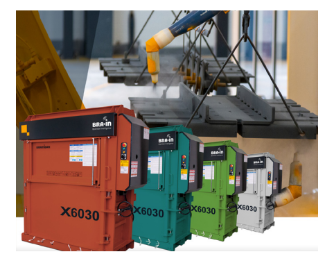
You can always order our balers in custom colors, and get your stickers placed on them as well.