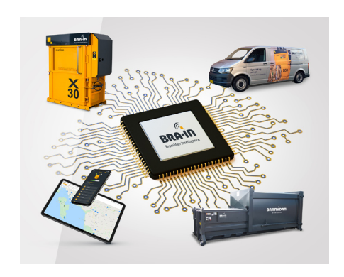
Built-in Intelligence monitoring system - called BRA-IN, optimizes use and logistics.