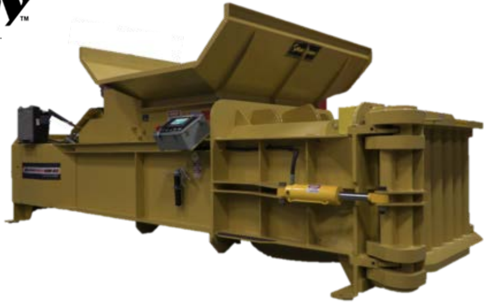
Shown With Ambidextrous Hopper