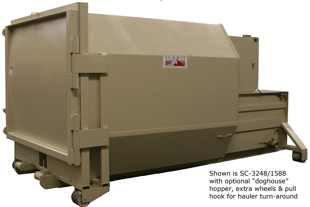
Shown is SC-3248/1588 with optional "doghouse" hopper, extra wheels & pull hook for hauler turn-around

The SC-3248 and SC-4060 compactors are designed to clean up your waste site by capturing and retaining waste, including liquids. At the same time, they reduce the number of times you have to empty, saving thousands of dollars all year long.