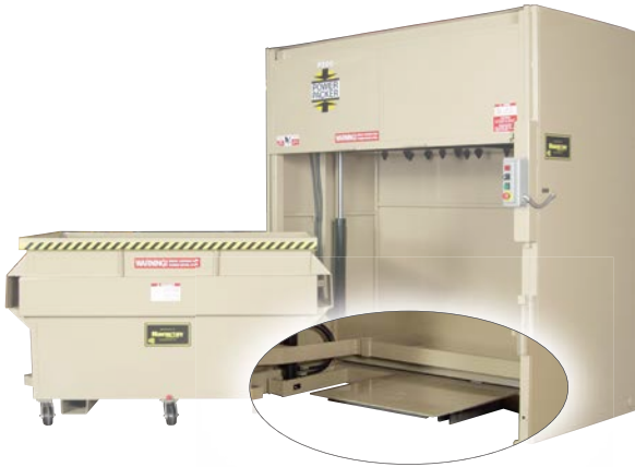
Container Support System